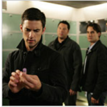
'Heroes' Is Ready for Its Rebound. Are the Fans?