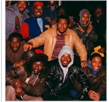
A Photographer Builds a History in Harlem

Home | World | U.S. | N.Y./Region | Business | Technology | Science | Health | Sports | Opinion | Arts | Style | Travel | Jobs | Real Estate | Automobiles | Back to Top