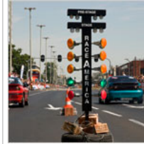
Where the Racing Is Fast and Police Aren't Furious