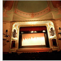
Left at the Theater Long Ago, Bringing It to Life