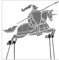
Op-Ed: The Risk of Too Much Oversight